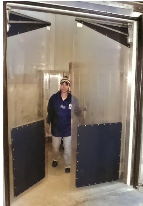
Shown with optional ABS Impact Plates.